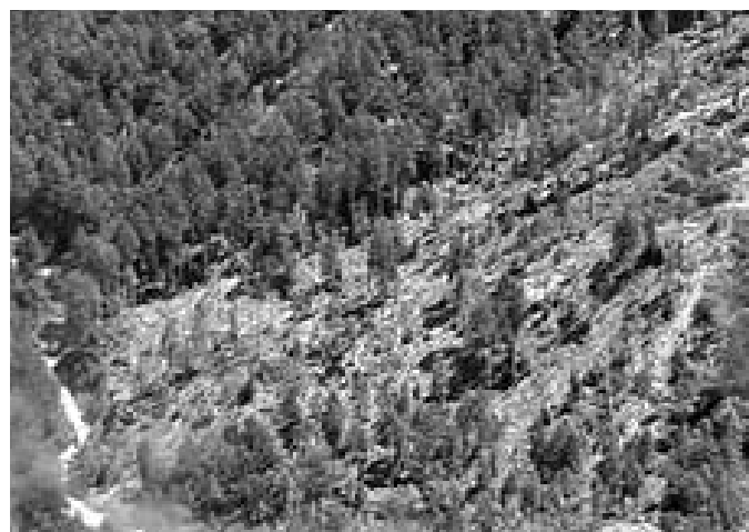
After years of more aggressive management, much of the Usal Forest is dominated by young conifers mixed with tanoak and other hardwoods.

One of the most unique aspects of the Usal Redwood Forest project is RFFI's commitment to the concept of a “working community forest.” RFFI's mission is to protect and manage forestlands and other related resources in the Redwood Region for the long-term benefit of local communities. A challenge facing RFFI is engaging local community members in a process which allows for meaningful input into how the property will be managed and provides for transparency in decision making. This local involvement, a fundamental tenet of community forestry, is reflected in RFFI's Mission Statement and guiding principles. RFFI's leaders believe that how well they succeed in their goal of active community involvement in the Usal Forest will strongly influence the overall success of the project.