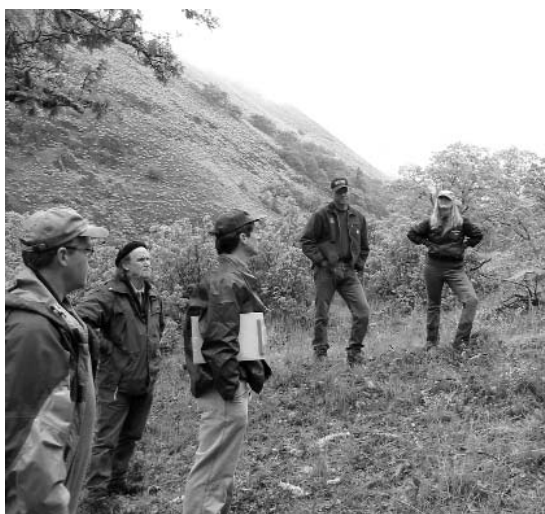
IRM staff in the field.

A. Our vision is to offer the full suite of services necessary to practice holistic forestry, with flexibility to conduct operations on projects from 20 to 20,000 acres. Our list of services can be a bit daunting to coordinate as an owner