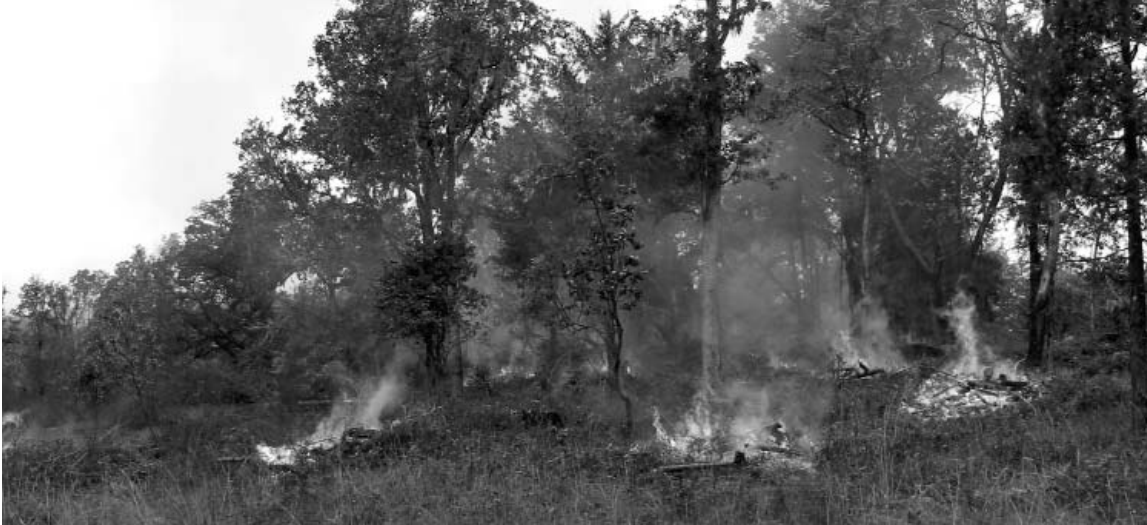
Pile burning of small diameter material as part of IRM's white oak restoration project in Oregon's Umpqua Valley.