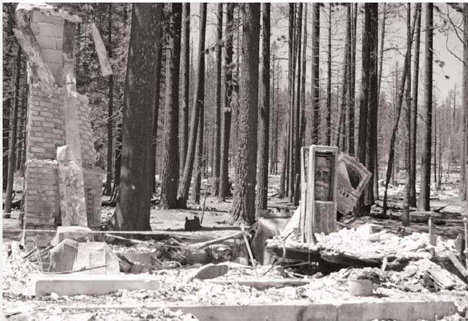
Building destroyed near South Lake Tahoe, California by the Angora Fire - June 25th, 2007.