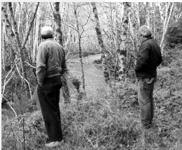
RFFI members survey the south fork of the Usal River.

Conservation Fund, an environmental non-profit specializing in land protection, to negotiate a conservation easement through California's Proposition 84 - Clean Water, Parks and Coastal Protection program. The easement will prohibit development on the property and enhance conservation practices. And since even