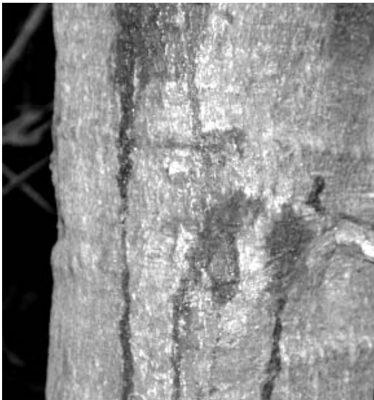
Sudden Oak Death close-up showing bleeding symptoms.

After thirty years experience with the legislation however, foresters are often considered the bearer of bad news to prospective clients as they describe the documentation and permitting requirements for issues such as stream crossings, ocean going fish, and water quality goals that may be needed to implement a forestry project – all in addition to basic professional forestry advice. In many cases, the total cost of complying with required public processes and permits